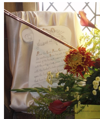
WI arrangement for the Flower Festival